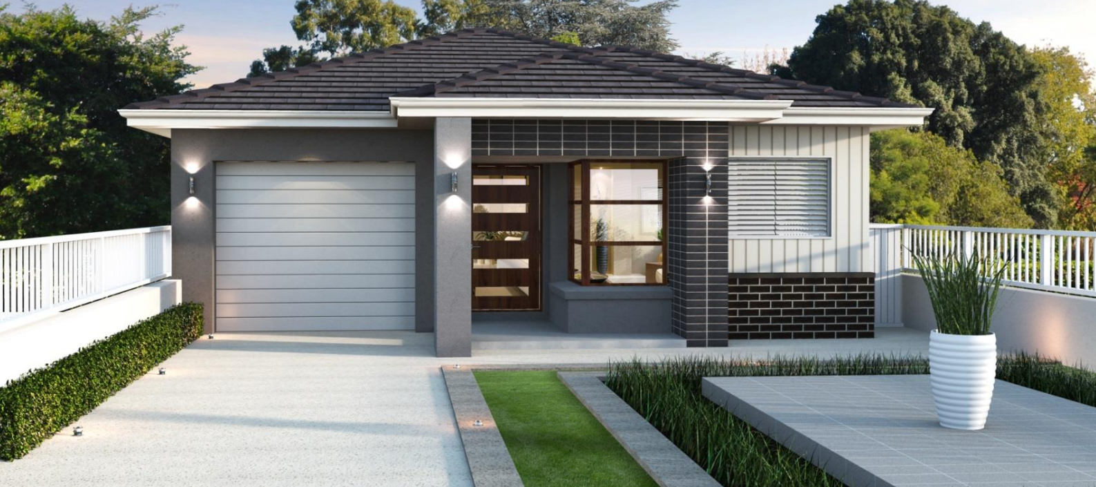
Façade is for illustration purpose only. This façade shows upgraded items not included in standard façade selection.