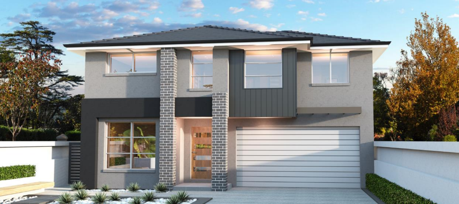
Façade is for illustration purpose only. This façade shows upgraded items not included in standard façade selection.